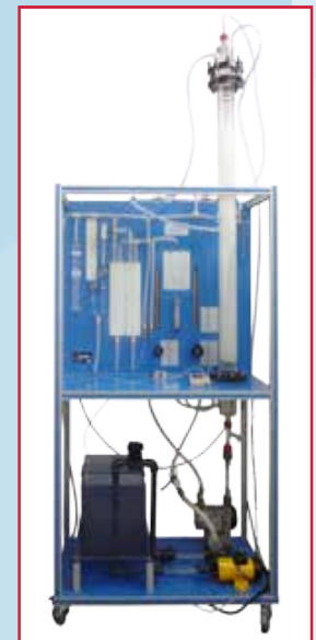
CAGC Computer Controlled Gas Absorption Column

SAVE TIME and INCREASE TEACHING EFFICIENCY with OUR COMPUTER CONTROLLED TECHNOLOGY