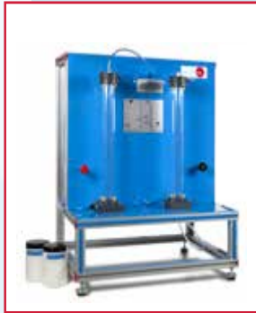
LFFC Computer Controlled Fixed and Fluidised Bed Unit