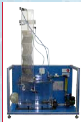
TTEC Computer Controlled Bench Top Cooling Tower