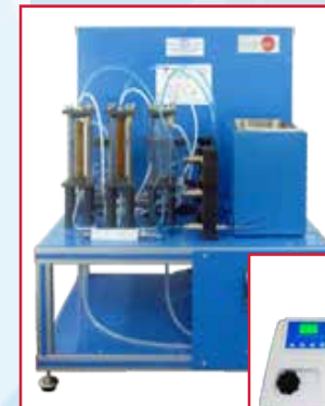
QRCC Computer Controlled Catalytic Reactors