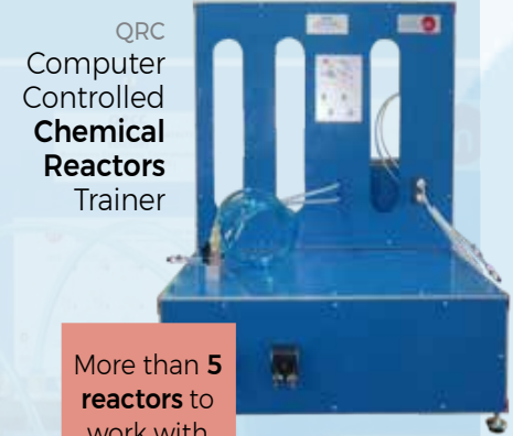
QRC Computer Controlled Chemical Reactors Trainer

More than 5 reactors to work with trainer: