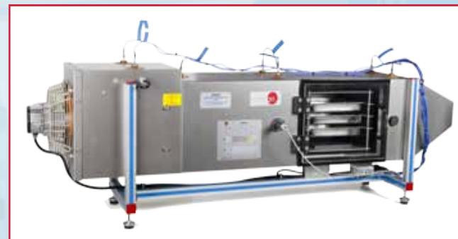
SBANC Computer Controlled Tray Drier