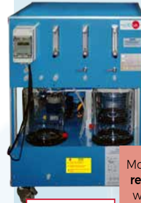
QRQC Computer Controlled Chemical Reactors Training System

More than 6 reactors to work with trainer: