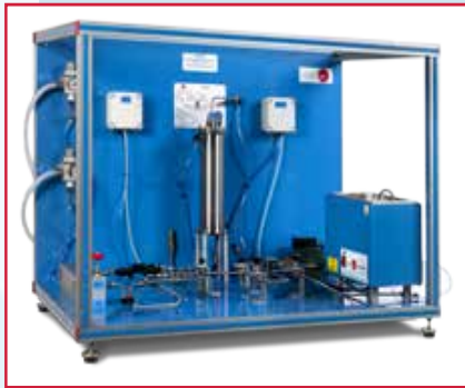
QALFC Computer Controlled Fixed Bed Adsorption Unit