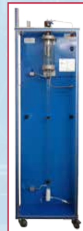
TFEC Computer Controlled Flow Boiling Demonstration Unit