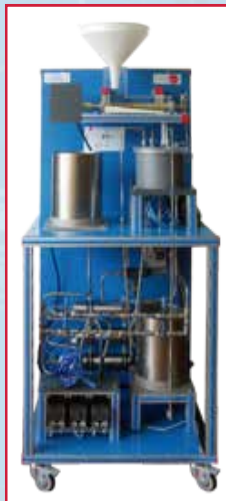
UELLC Computer Controlled Liquid-Liquid Extraction Unit