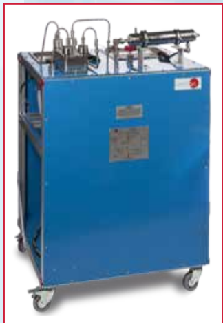
ROUC Computer Controlled Reverse Osmosis/ Ultrafiltration Unit