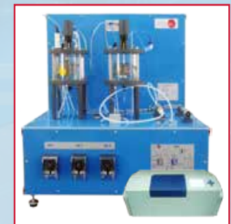
QREC Computer Controlled Batch Enzyme Reactor