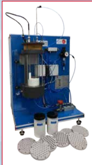
TTLFC Computer Controlled Fluidisation and Fluid Bed Heat Transfer Unit